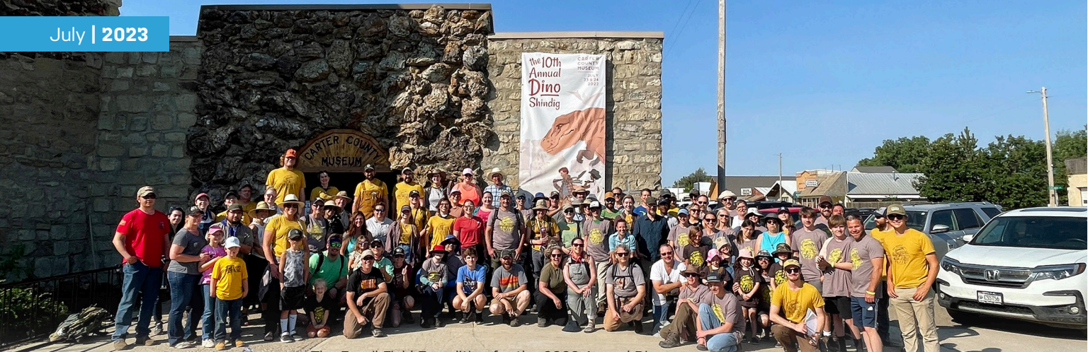
The Fossil Field Expedition for the 2022 Annual Dino Shindig in Ekalaka.