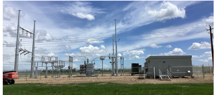
The new Albion substation was energized in June.

also be able to provide loop redundancy for Ekalaka if the transmission line to Baker trips out.