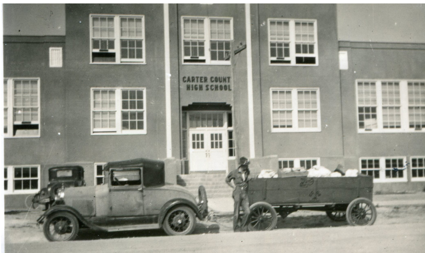
A truck and trailer in front of Carter County High School during the 1938 Limited Safari.